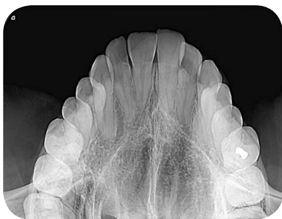
Occlusal images for the diagnosis of jaw fractures, impacted teeth, cysts and ulcers

A comparison of the effective image resolution of X-ray systems: The VistaScan systems from Dürre Dental achieve a higher resolution than the products of competitors. The latest studies show: Image plate technology is the only way to achieve digitisation without compromise.