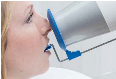
Image plate holder system

Image plate holders from Dürr Dental offer optimum protection for the image plate with their smoothed and rounded edges. Holders are available for all applications – their use helps to ensure that accurate X-ray images are produced.