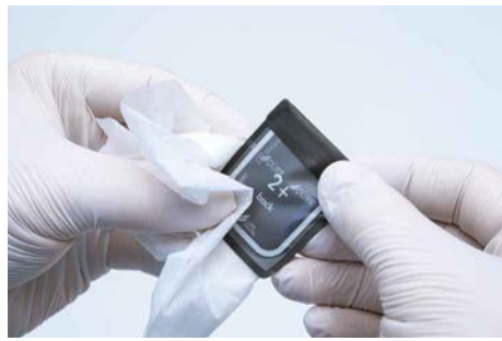
Image plate holders from Dürr Dental offer optimum protection for the image plate with their smoothed and rounded edges. Holders are available for all applications – their use helps to ensure that accurate X-ray images are produced.