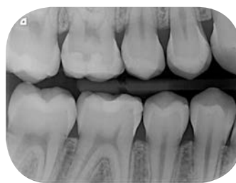
High-resolution bite wing X-rays for perfect diagnosis