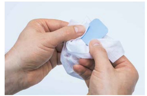
Image plate cleaning wipes

The FD 350 disinfection wipes from Dürr Dental are particularly suitable for wipe disinfection and cleaning of medical devices. Thanks to their size they are a perfect and inexpensive way to clean small surfaces or objects, e.g. sleeves of intraoral plates and films, straight and contra-angle hand pieces, etc., they can be used straight out of the pack and are quick and residue-free. The disinfection wipes FD 333 offer a fully virucidal solution.